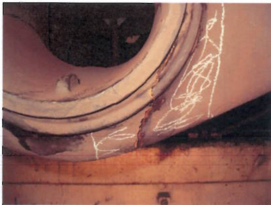
Fig 3 Fracture found - outside view