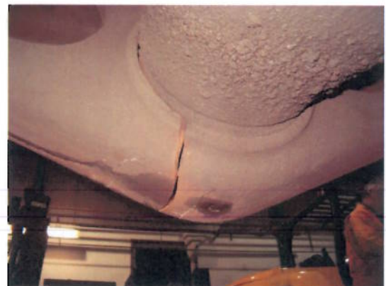
Fig 4 Fracture found - inside view